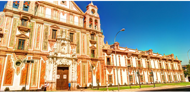
▲ LA MERCED PALACE

There are also interesting art centres like the Palacio de la Merced , a former convent that hosts temporary exhibitions. The building is one of the best examples of Cordoba's Baroque, with a particularly fine main cloister.