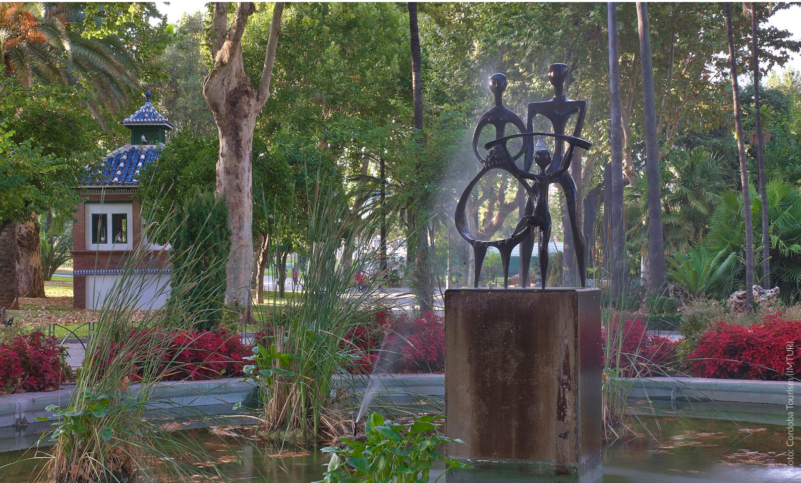
▲ LA AGRICULTURA GARDENS

If you still have time and would like to discover more, here are some possibilities to add to your itinerary. There's no question; it is well worth spending time to discover all the charms of this city.