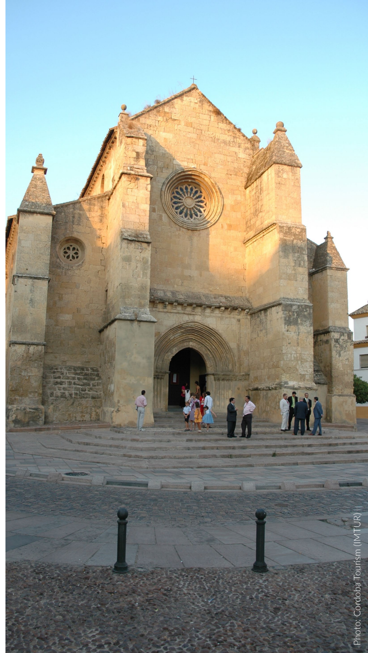
▲ CHURCH OF SANTA MARINA

San Agustín Church has a wonderful interior, one of the jewels of the Baroque in Cordoba. Thanks to its recent restoration, beautiful murals and frescos of great chromatic richness are now visible. It has many similarities with the chapels of San Cayetano Church , located on a steep street called Cuesta de San Cayetano. It has stunning vaults and decorative details.