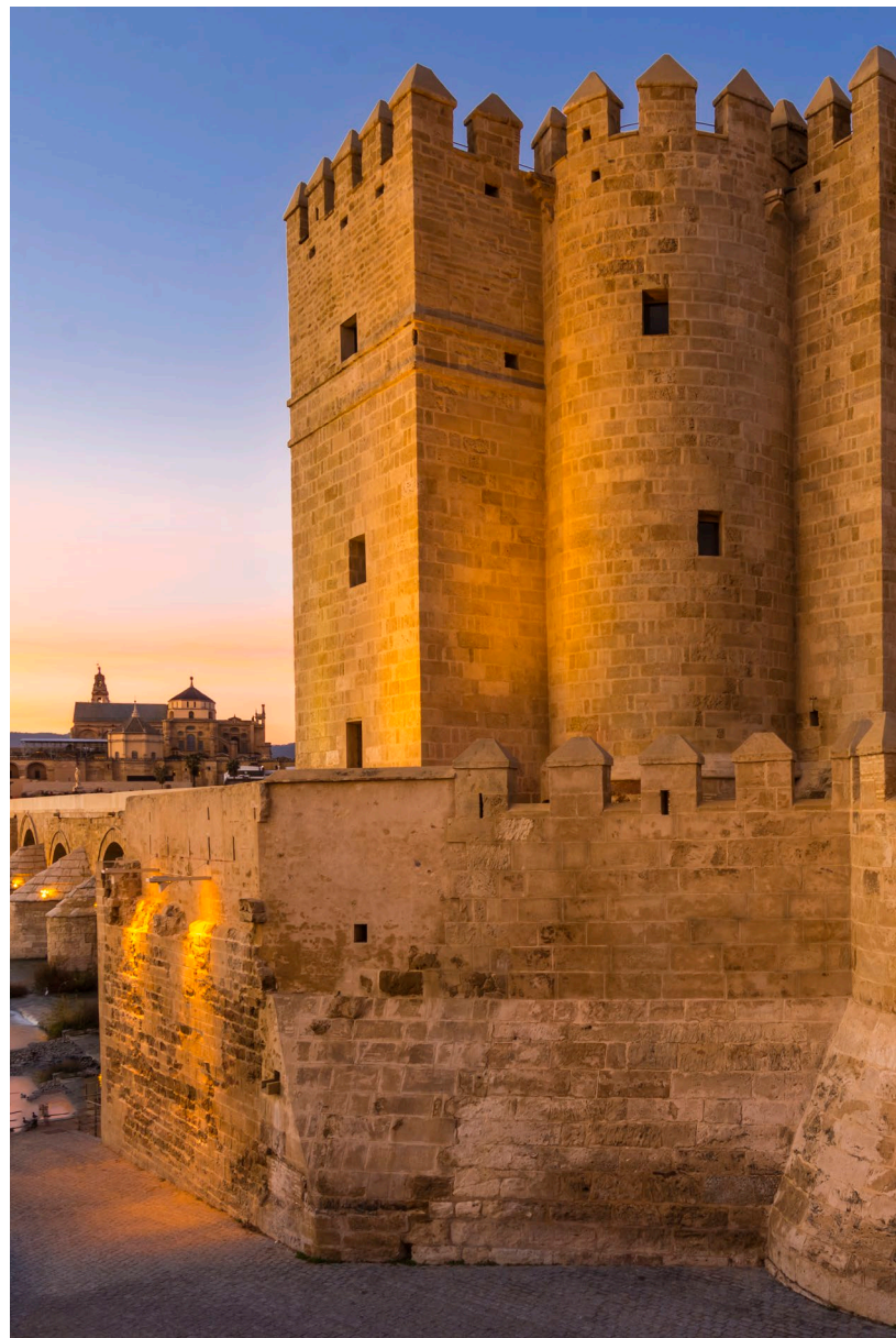
▼ CALAHORRA TOWER

If you are looking for a fuller panoramic view, about 15 kilometres from the city you will find the Las Ermitas shrines complex, a place of religious meditation since the Middle Ages. The site includes a magnificent lookout point under the shadow of the monument to the Sacred Heart of Jesus. From there you will get a wonderful view of the city and part of the Guadalquivir River's fertile plain.