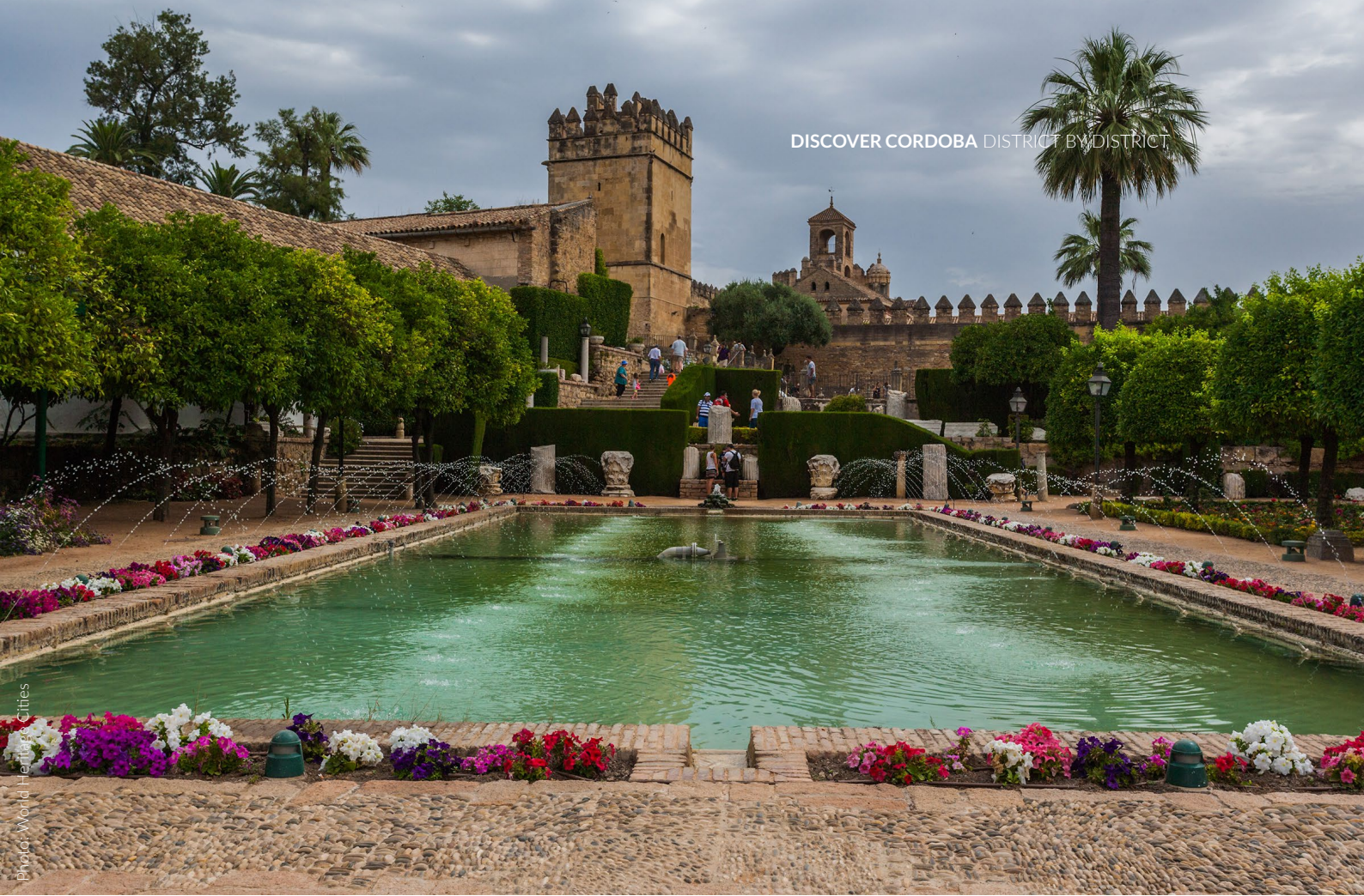
▲ ALCÁZAR DE LOS REYES CRISTIANOS FORTRESS