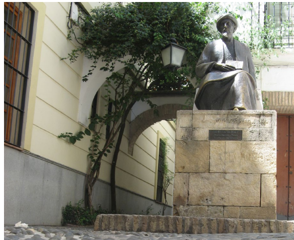
▲ PLAZA MAIMONIDES SQUARE AND THE STATUE OF MAIMONIDES

Also in the Jewish Quarter, documenting the city's Jewish past, is the House of Sepharad - House of Memory . It has a permanent exhibition in several rooms, exploring highlights of the Sephardic tradition and its subsequent development in the diaspora.