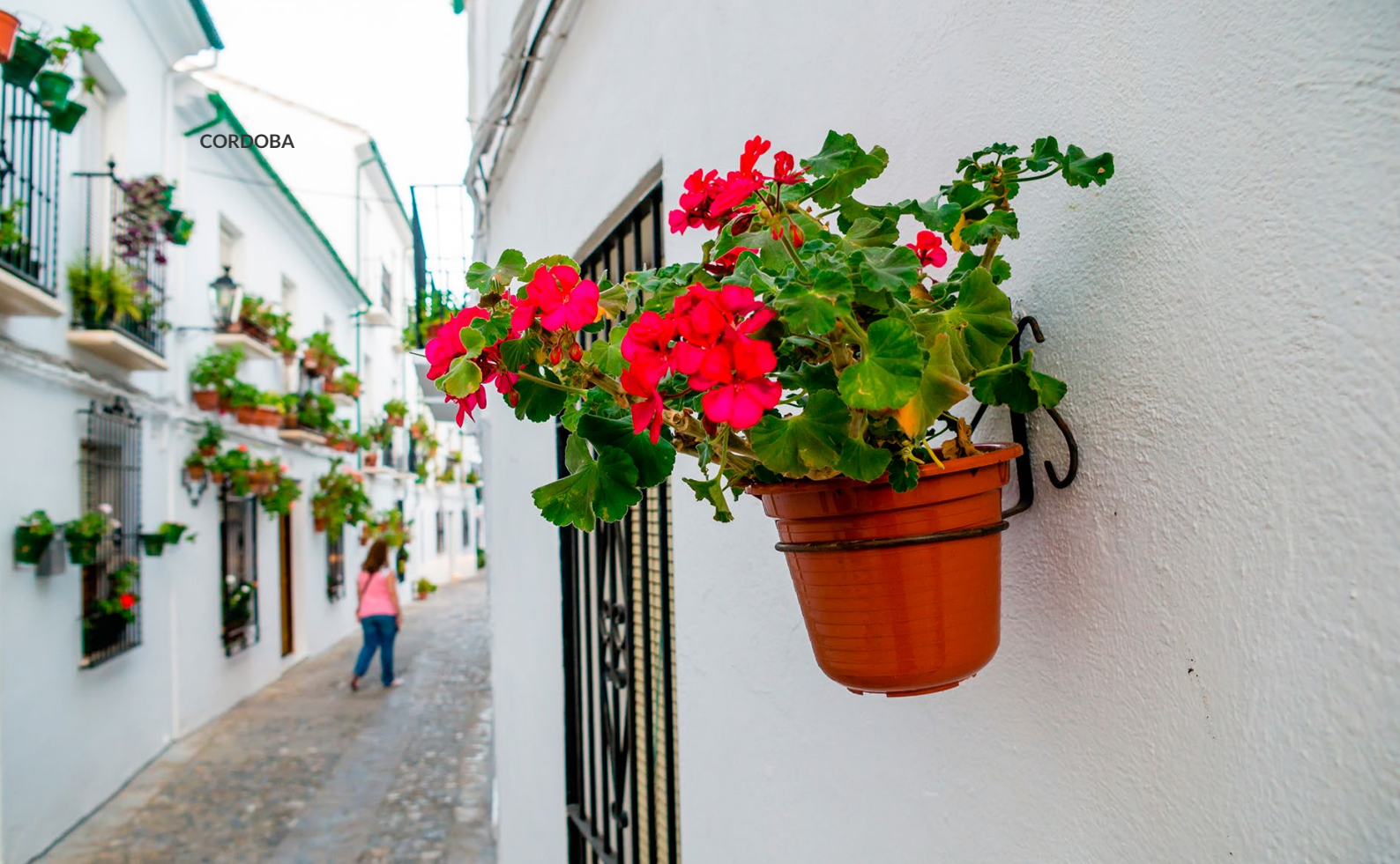
▲ PRIEGO DE CÓRDOBA

If you want to explore one of the oldest towns in the region, head for the lovely Cabra . Surrounded by mountains, springs and natural sites of great beauty, it preserves its Al-Andalus past in its double walled enclosure and in the beautiful Condes de Cabra castle. It also has some of the most interesting Baroque architecture in Andalusia, with such jewels as the parish church of Nuestra Señora de la Asunción y Ángeles.