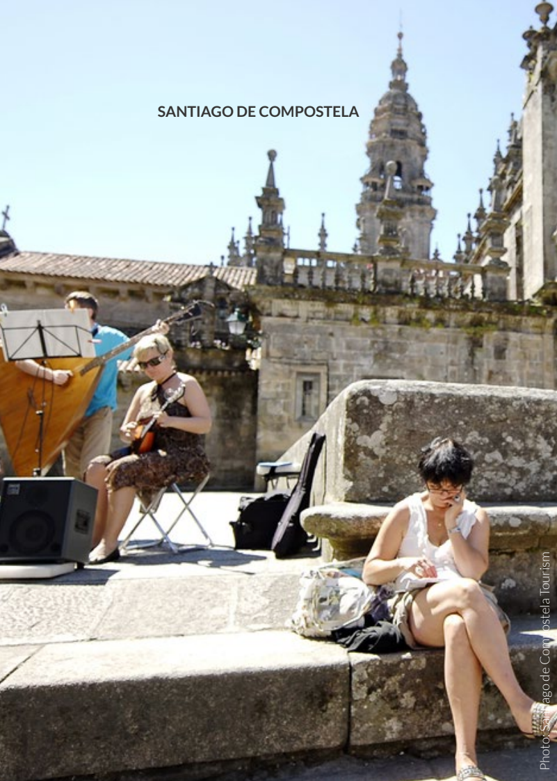
▲ PLAZA DE PLATERÍAS