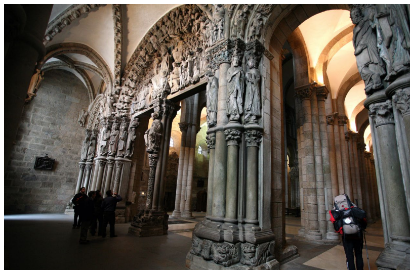
▼ PÓRTICO DA GLORIA

The whole area inside the walls is scattered with ancient aristocratic houses and