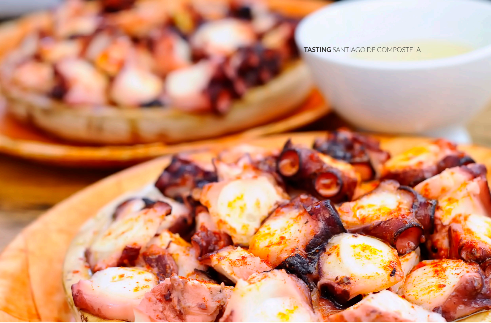
▲ OCTOPUS 'A FEIRA'