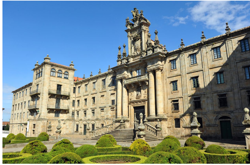
▲ MONASTERY OF SAN MARTÍN PINARIO

The Praza da Quintana is another iconic location in Santiago's historical old town. This features the Torre del Reloj or Clock Tower which can be seen from almost anywhere in the city. Take a