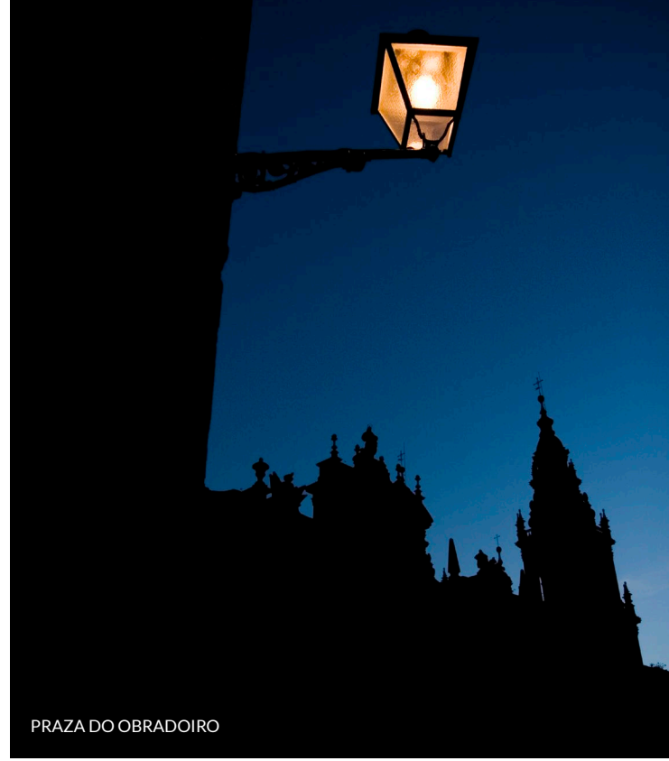
PRAZA DO OBRADOIRO

The Convent of Belvís and the stately Seminario Menor are separated from the monumental area by a natural ditch. Then you can wander around the Belvís Park . All around this area there are amazing views over the city.