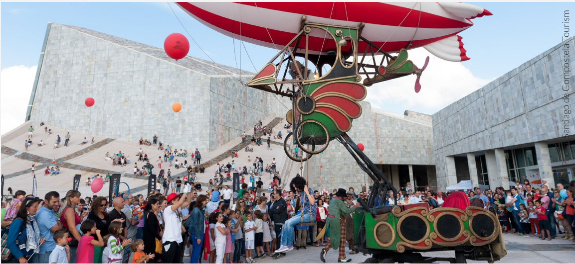
Santiago de Compostela Tourism