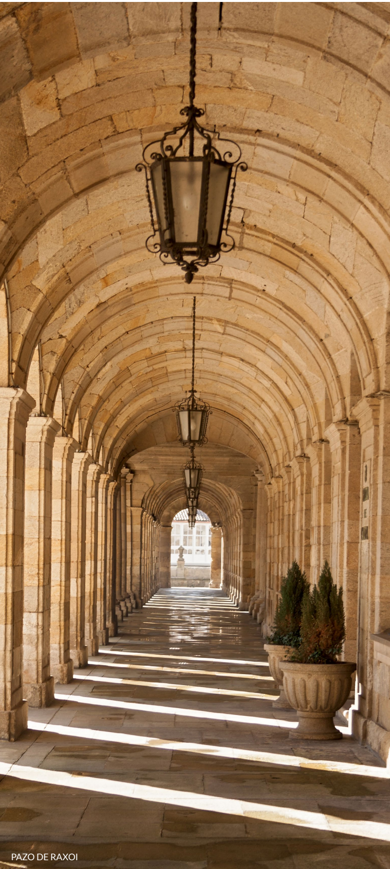
PAZO DE RAXOI

examples of civil architecture which have become real monuments: these include the Casa do Deán , the Casa do Cabido , the Casa da Conga , the Casa das Pomas , the Pazo de Fondevila y the Casa-Pazo de Vaamonde . A walk along the Rúa Nova, alongside the cathedral and one of the busiest streets in the historical old town, will take you past some extraordinary examples of this city's monumental stature.