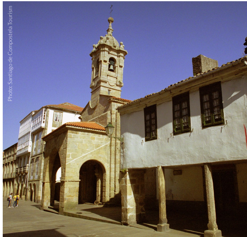
▲ CHURCH OF SANTA MARÍA SALOMÉ

For in-depth research into the Way of Saint James you should visit the Pilgrim's Museum , which exhibits sculpture, paintings and icons related to Saint James. There are eight exhibition rooms illustrating the origin of the cult of the Apostle, the initiation and development of pilgrimages and their influence on artistic development in the city's craft guilds.