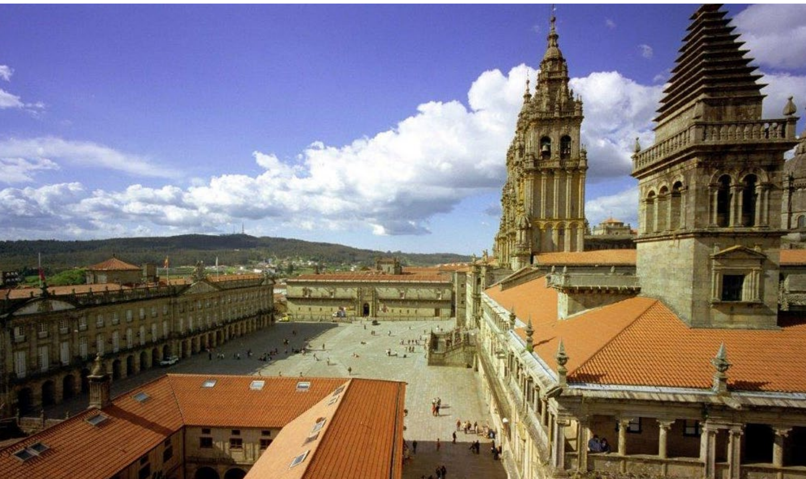
▲ PLAZA DO OBRADOIRO

Explore the delights of this city's iconic districts: inside and outside the walls.