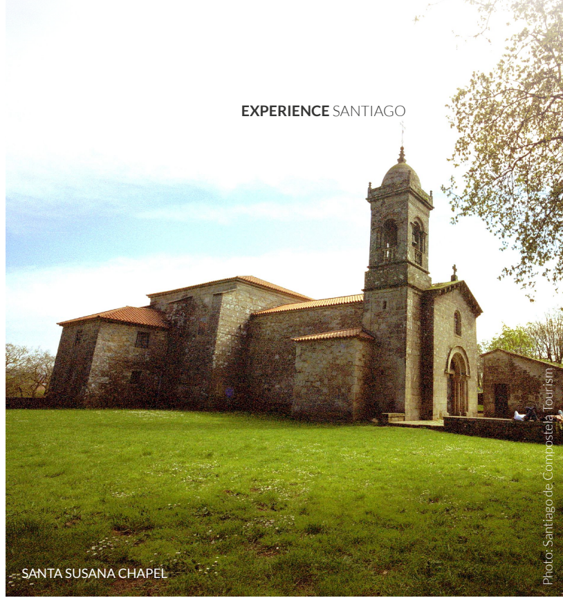
SANTA SUSANA CHAPEL

If you cross over to the Sar neighbourhood you can visit the 12th-century Collegiate Church of Santa María A Real do Sar , with a sombre Romanesque exterior and a beautiful interior which houses the city's only Romanesque cloister and a small religious art museum.