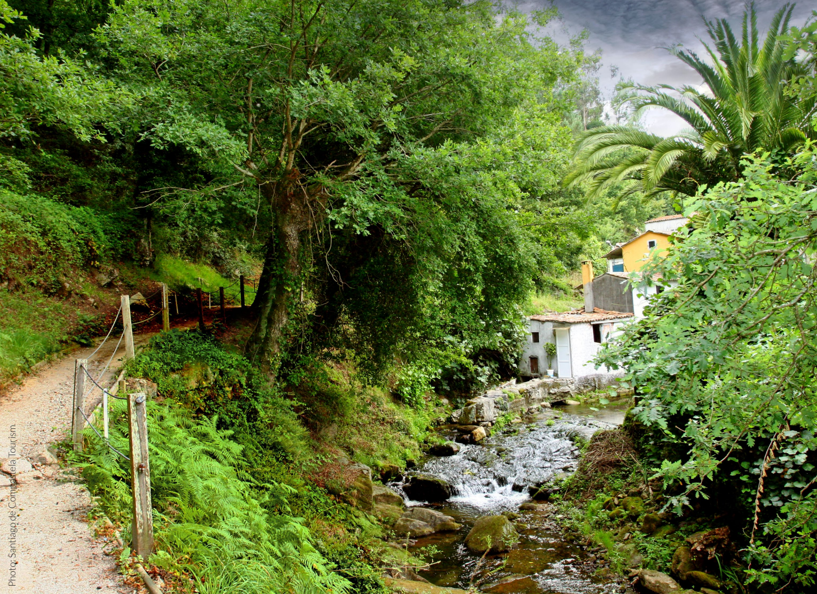
▲ PASEO DE SARELA