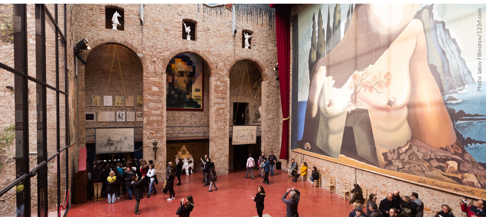
▲ DALÍ THEATRE-MUSEUM FIGUERES

All along the Mediterranean coast and in the nearby towns, apart from beaches and fantastic weather, there are great opportunities to explore the history, culture and art of Spain. Historical town centres, traditional festivals and museums and monuments will help you discover the true essence of the Mediterranean. Here are a few suggestions to help you enjoy your stay.