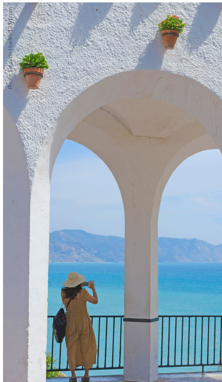
▲ BALCÓN DE EUROPA NERJA, MÁLAGA

Beneath the Balcón de Europa , a square overlooking the sea which has become the icon of Nerja, you can go for a swim