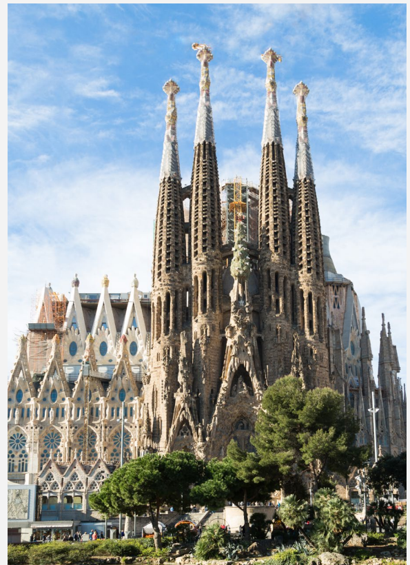
▼ THE SAGRADA FAMILIA BARCELONA

In the heart of Barcelona stands the Basilica of La Sagrada Família , the icon of the city and its greatest exponent of Modernism. It is the work of the genius architect Antoni Gaudí , its most spectacular feature being the spires. You can climb to the top of some of them and get a beautiful panoramic view of Barcelona from high up.