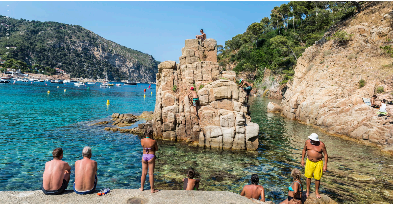
▲ PLAYA DE AIGUABLAVA BEGUR, GIRONA

amazing lookout point with fantastic views over the Bay of Roses and the town of L'Escala. Very near the beach you'll also find the Greco-Roman ruins of Empúries , one of the most important archaeological sites in Spain.