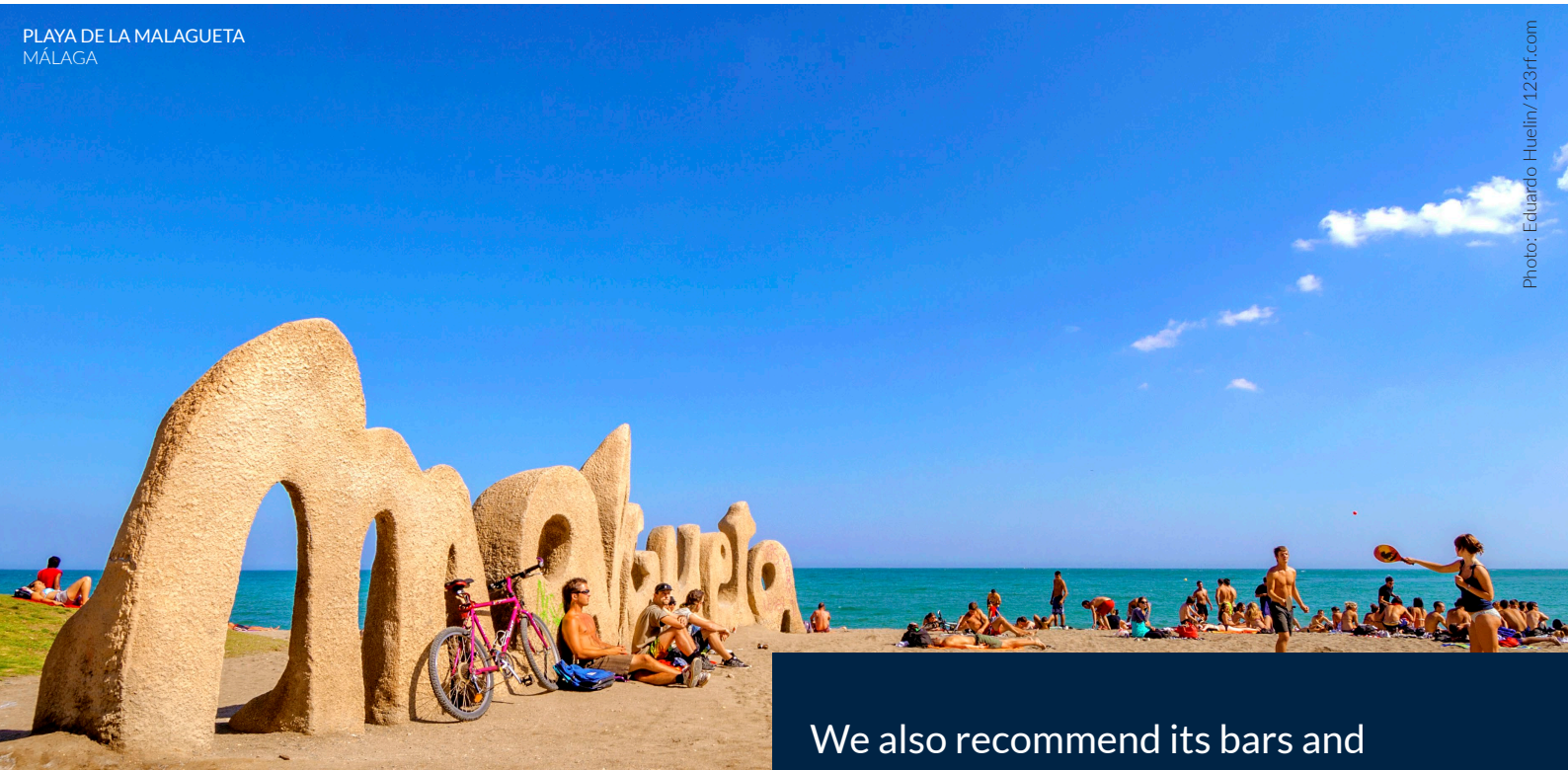
PLAYA DE LA MALAGUETA MÁLAGA

We also recommend its bars and restaurants, especially at dusk, when you can enjoy an unforgettable sunset