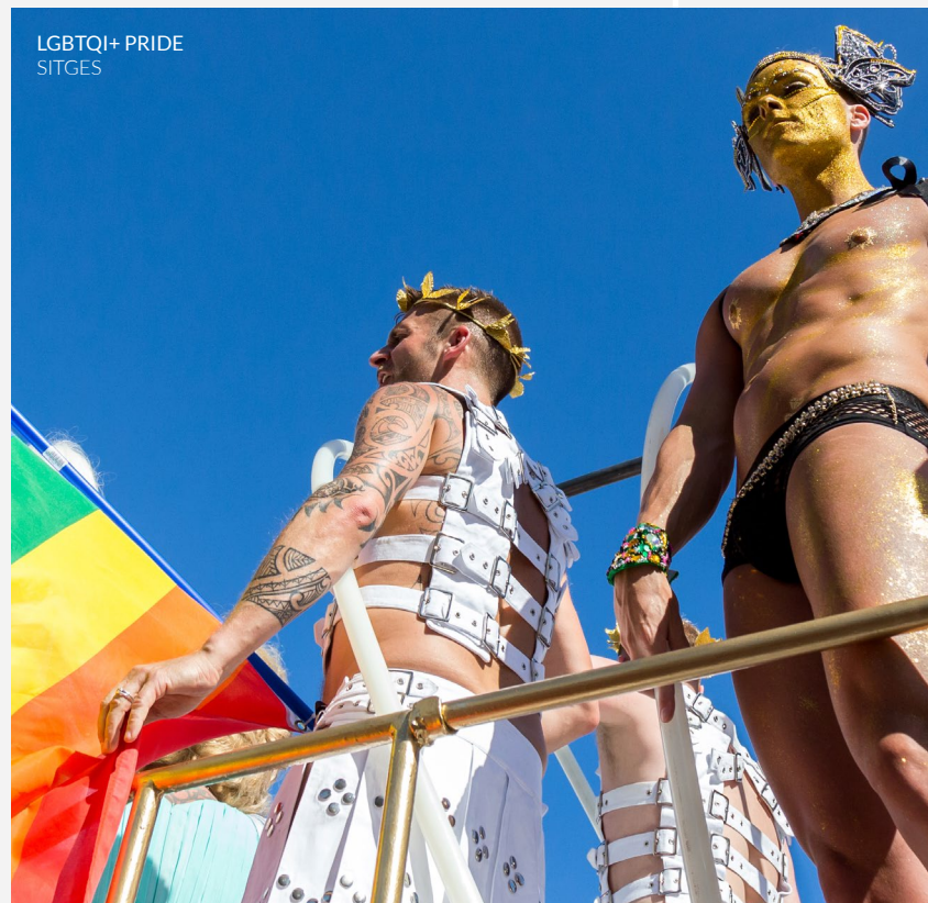
LGBTQI+ PRIDE SITGES

Sitges Pride (Barcelona) has become a standard for Gay Pride Festivals in Spain. There are numerous performances and theme parties in the city's clubs and a great protest parade. You'll really enjoy the colourful, festive atmosphere in the city during these days in June.