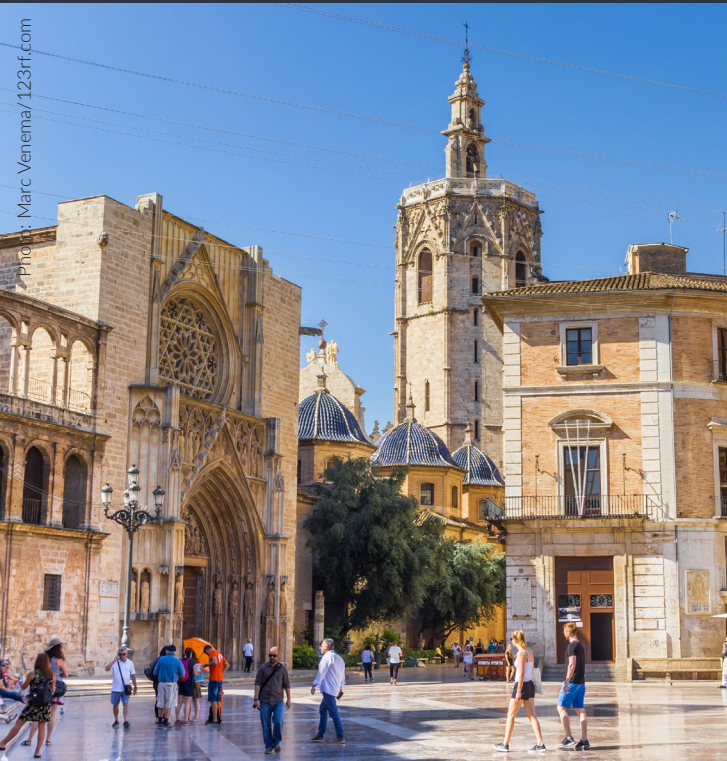
▲ VALENCIA CATHEDRAL VALENCIA