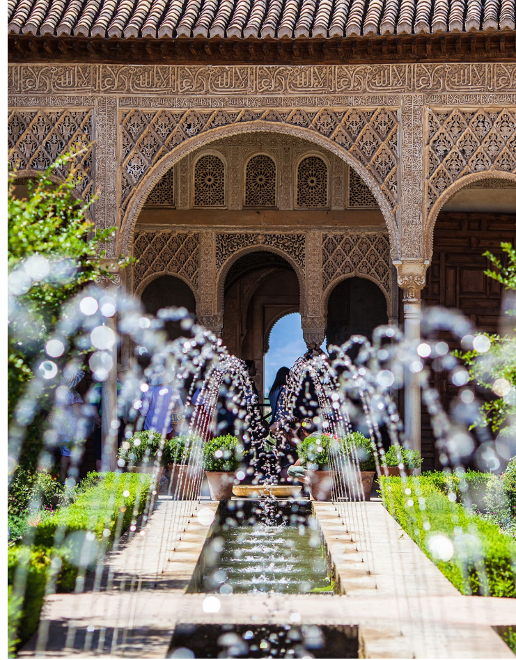
▲ GENERALIFE GARDENS, ALHAMBRA GRANADA

The essential monument to visit on any trip to Granada is La Alhambra , a palace, a citadel and a fortress in successive eras and now one of the most important artistic legacies in all Spain.