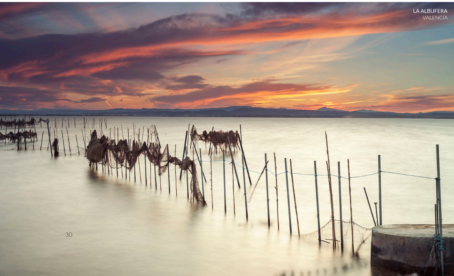
LA ALBUFERA VALENCIA

This is the most important wetland in the Murcia region and it is ideal for bird watching. At the end of June, thousands of flamingos gather here and create a spectacular pink landscape. A short tour as the sun comes up over the salt pans, hiking along the well-signposted trails and a therapeutic mud bath are just some of the incredible experiences you can enjoy in these peaceful, privileged surroundings.