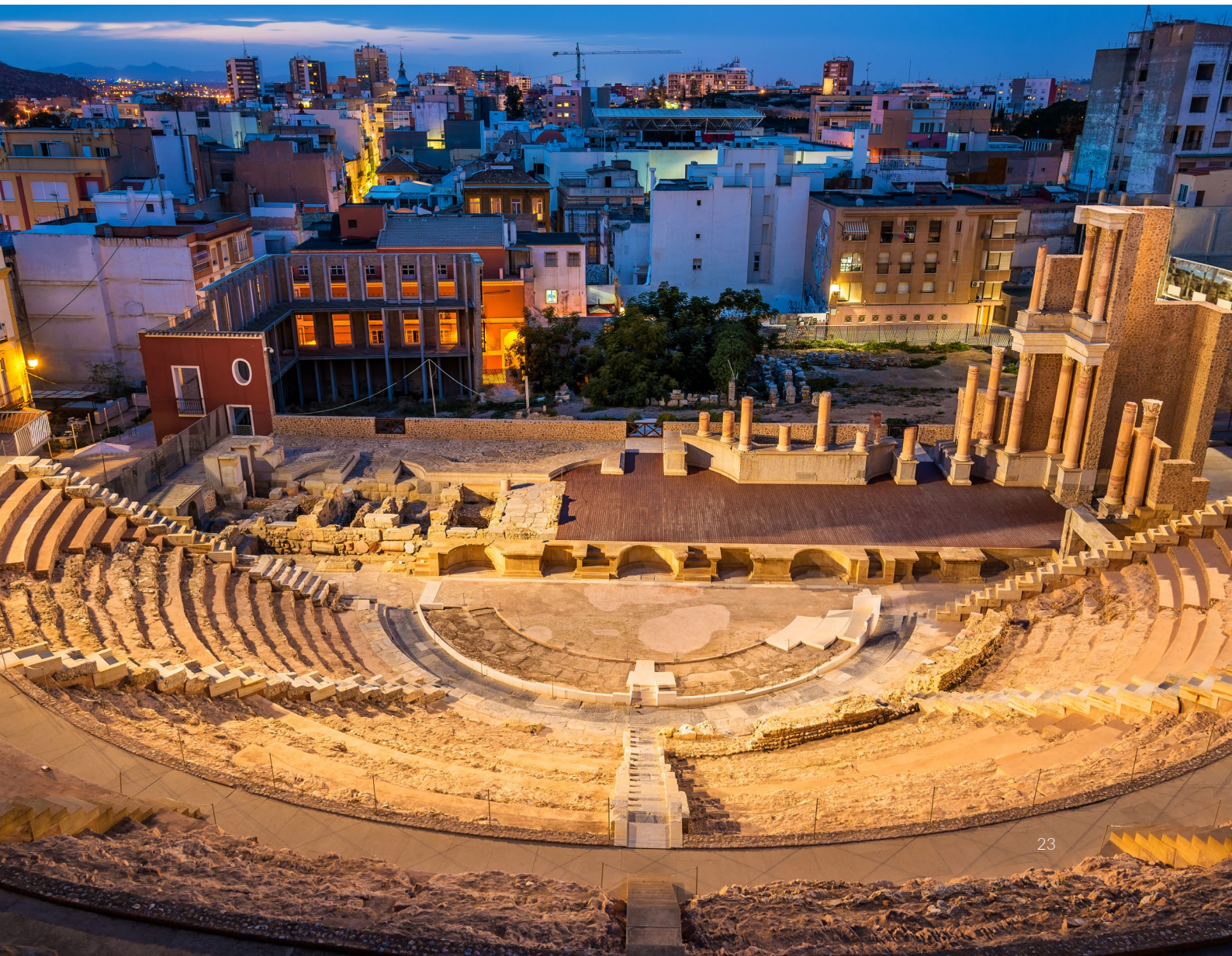
▼ ROMAN THEATRE, CARTAGENA

One of the most moving moments takes place right at the door of the Church of Santa María de Gracia , at the conclusion of the processions with the arrival of the Virgin Mary, when thousands of people sing the Salve Popular Cartagenera , a religious song.