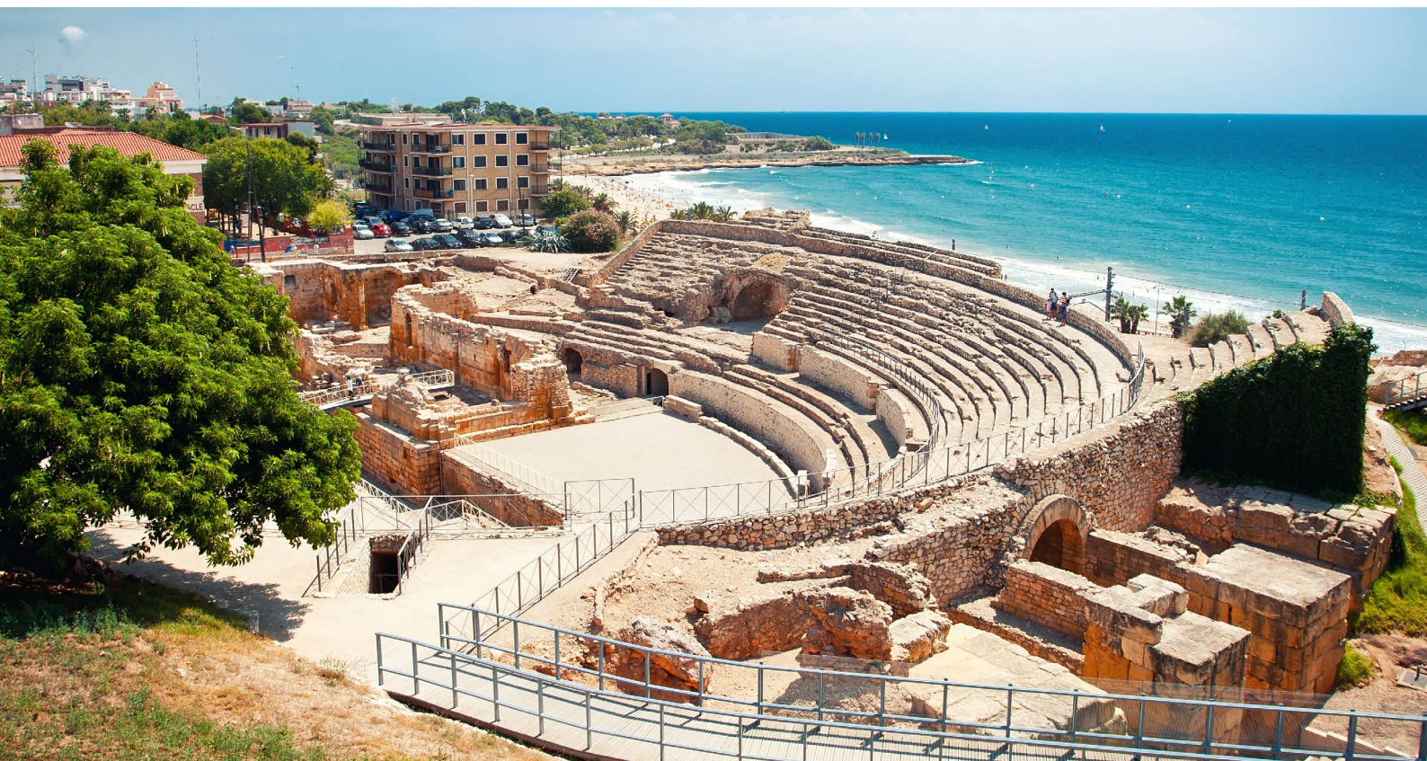
▲ ROMAN AMPHITHEATRE TARRAGONA