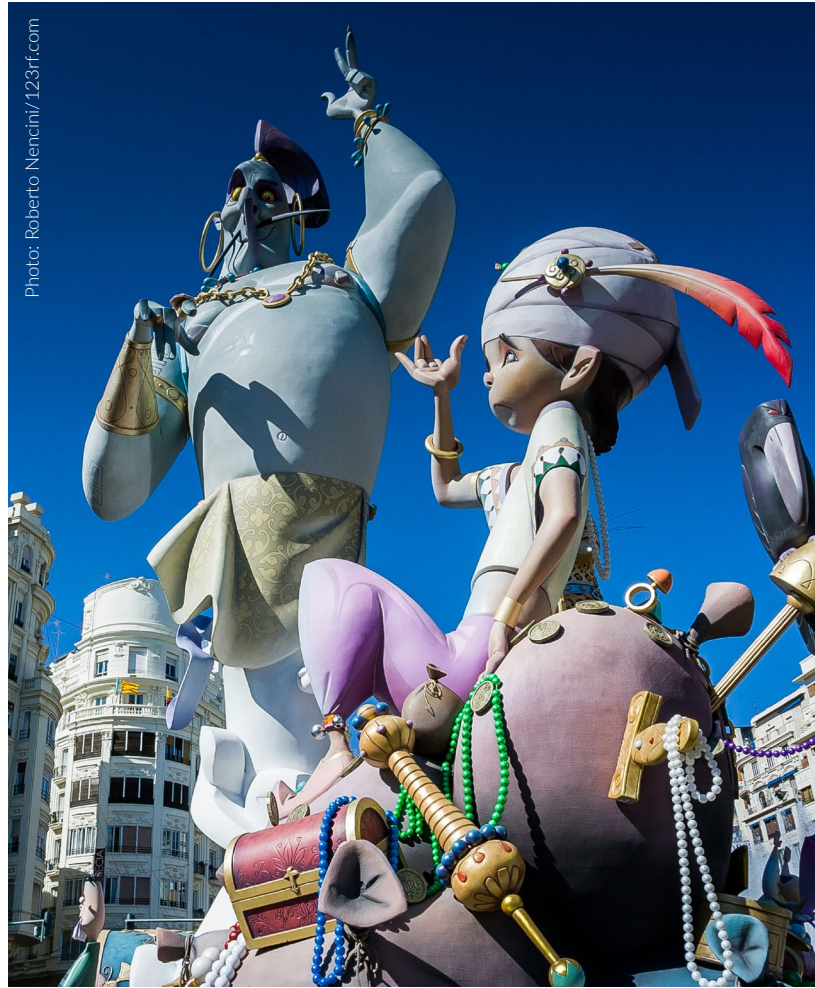
▲ LAS FALLAS BONFIRE FESTIVAL VALENCIA

Nearby you'll find the El Miguelete , as the bell tower of Valencia Cathedral is known. From the top, 50 metres up, you get an incredible panoramic view of the city.