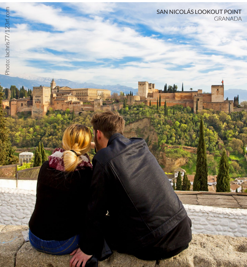
SAN NICOLÁS LOOKOUT POINT GRANADA

To fully appreciate the architectural values and the landscape of this UNESCO World Heritage site you should climb up to the San Nicolás lookout point in the Albaicín neighbourhood or to Sacromonte . From there you'll be able to discern the spectacular relationship between the Alhambra, the surrounding territory and the city of Granada.