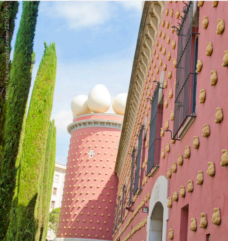
▲ DALÍ THEATRE-MUSEUM FIGUERES

In the beautiful area surrounding Cadaqués you'll find the little fishing village of Portlligat where you can visit the Dalí House-Museum , a fisherman's cottage where the artist spent large parts of his life. You can see the workshop with the tools he used and an outdoor area with numerous Surrealist references.