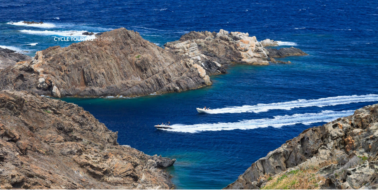
CAPE OF GREUS GIRONA

The route is 2,000 km long and some sections coincide with the GR routes or shorter distance trails. 35% of the route goes through protected nature areas. You'll be able to discover the wild beaches in the Cabo de Gata-Níjar Nature Reserve and Biosphere Reserve in Almería, look out over the Strait of Gibraltar and visit the picturesque towns and villages in the Alpujarra mountains in the foothills of the Sierra Nevada .