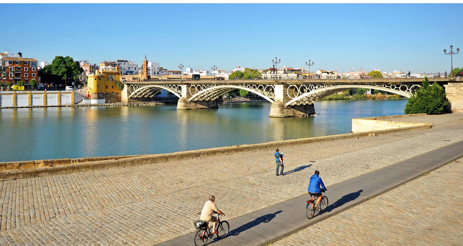
▼ PUENTE DE ISABEL II BRIDGE SEVILLE

When you are ready to take refuge in the shade you can cycle along the tree-lined alleys in the María Luisa Park , admire the vegetation and discover the spectacular Plaza de España . From here you can continue along the bike lane until you reach the banks of the Guadalquivir River. If you follow the river you'll be guaranteed a pleasant bike ride with the opportunity to discover more monuments and green areas, like the Alamillo Park on the Island of La Cartuja .