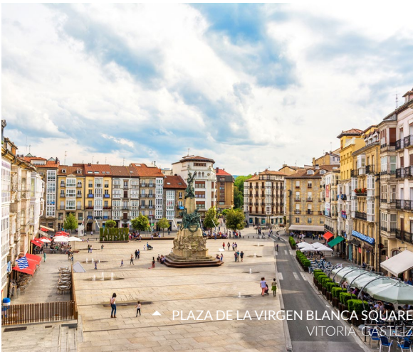
▶ PLAZA DE LA VIRGEN BLANCA SQUARE VITORIA-GASTEIZ