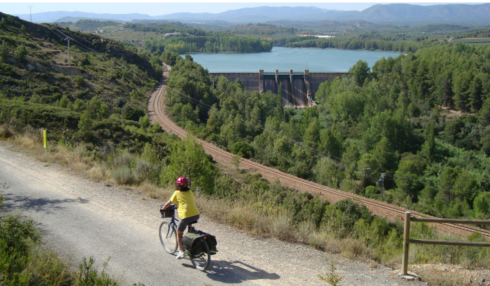
▲ OJOS NEGRO GREENWAY CYCLING ROUTE CASTELLÓN